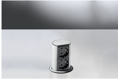
Casper 8000 014